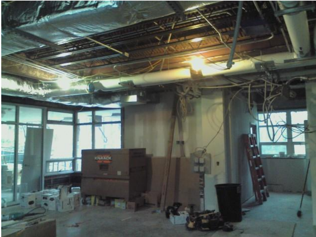
Taylor Building Elevator Addition