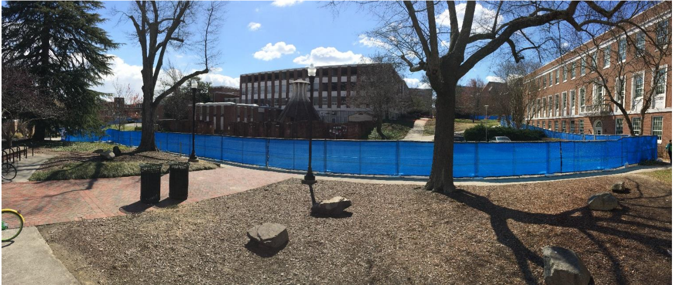
South Chiller Plant