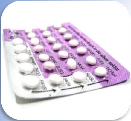
Birth Control Pills