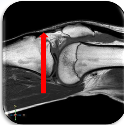
Anterior Knee Laxity