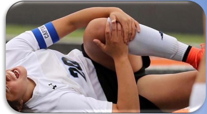
ACL Injury Risk