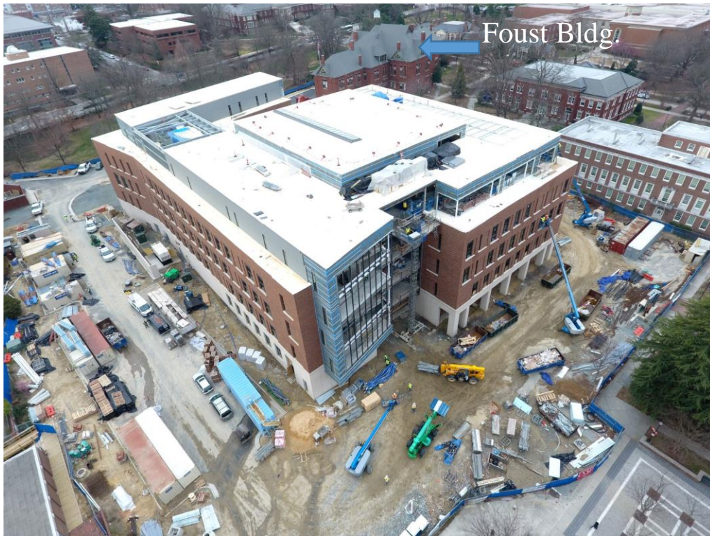
Southwest aerial view of building and site.