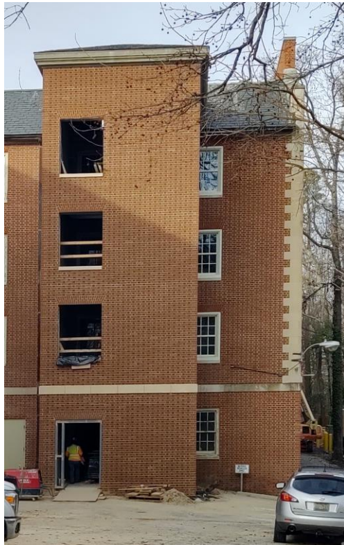
New elevator shaft in progress.