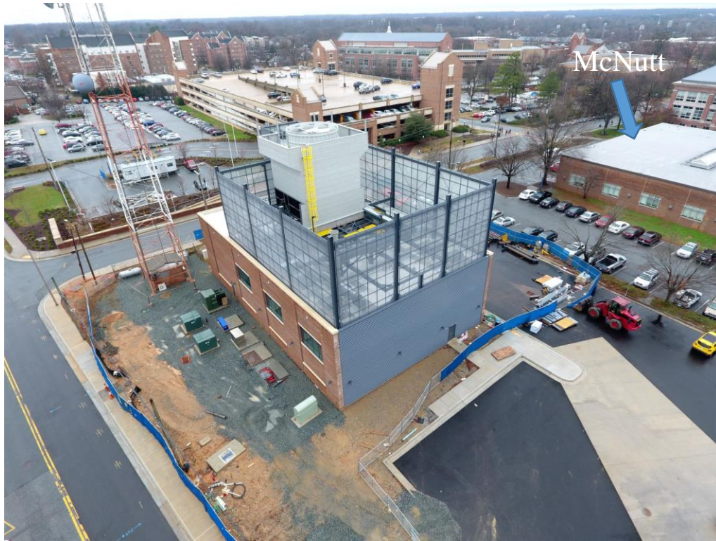
Northwest aerial view of the new chiller plant located on the corner of Oakland Avenue