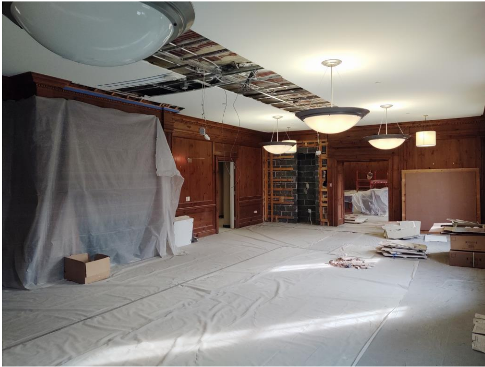
Interior renovation is underway. Shown here is the existing conference room.