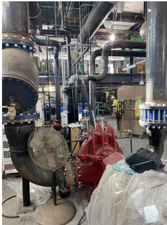
Chilled Water Pumps in Mechanical Room