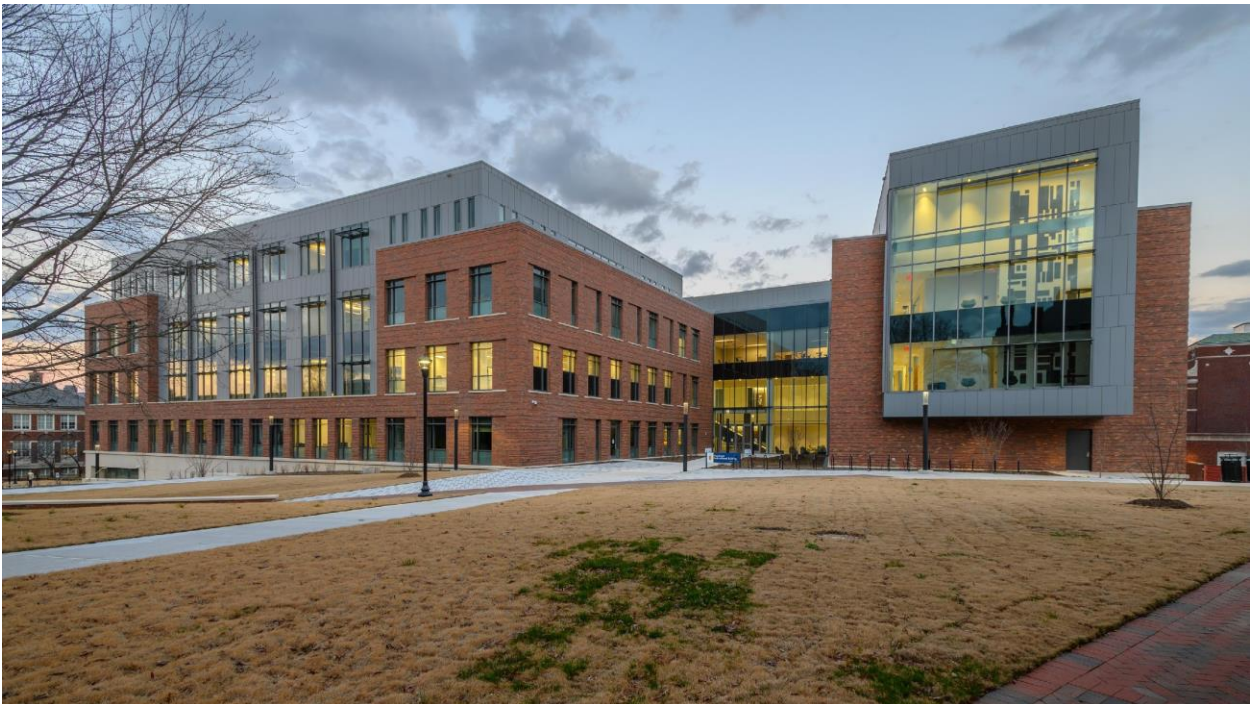
Looking from the Forney Building