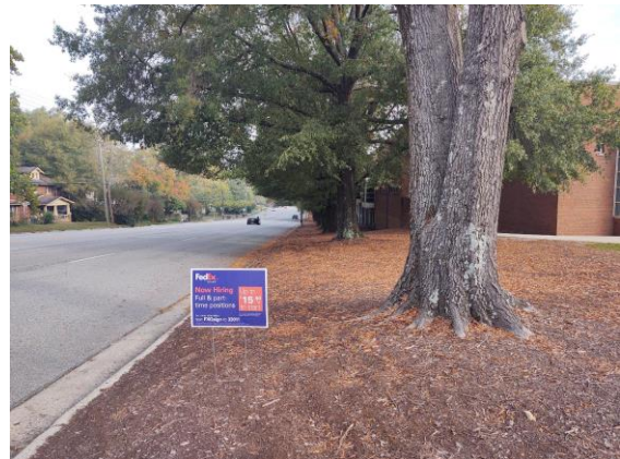
Standing on the corner facing north