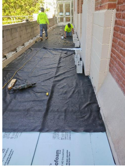
Looking west towards the Rotunda