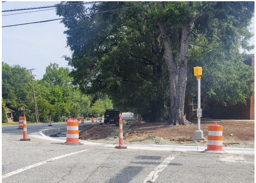
Walker Avenue corner, turning North