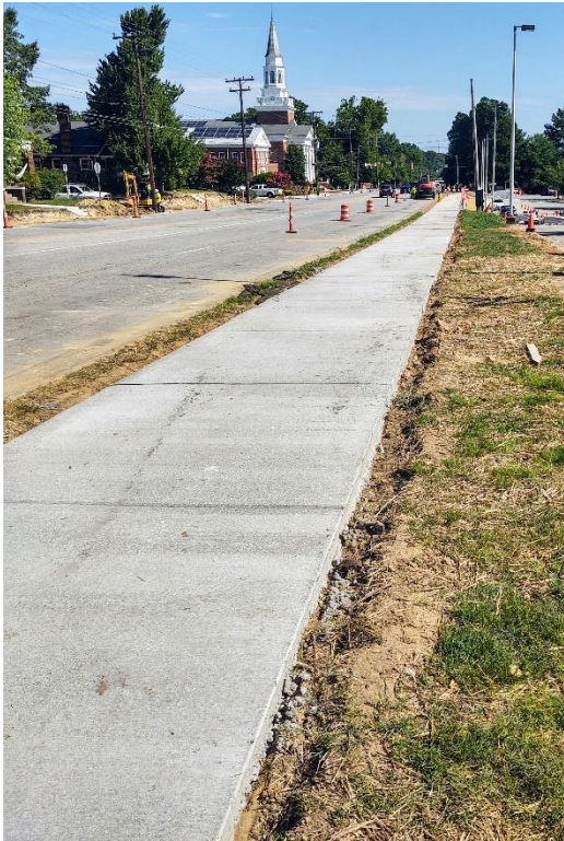
Looking North at Walker Ave corner