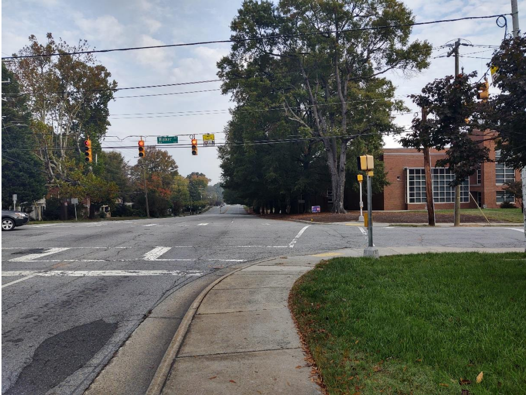
Corner of Walker Avenue and South Josephine Boyd Street- Pre-existing