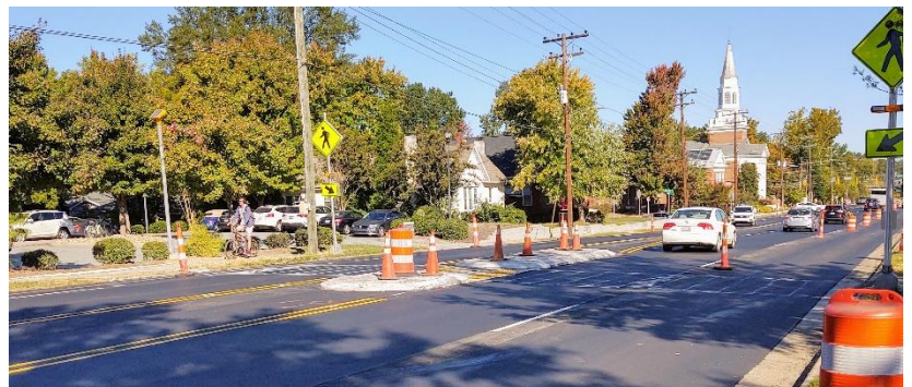
Corner Walker Ave. and S. Josephine Boyd