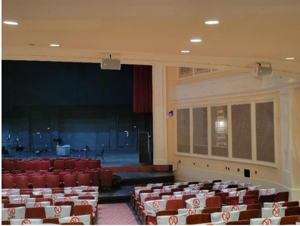
New white speakers installed in the same location as the previous speakers.