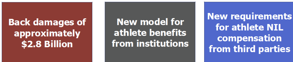
Figure 3 from the Knight Commission on Intercollegiate Athletics: Overlooked & Changing Realities: What You Need to Know About the House Settlement , presented at the 2025 NCAA Convention: Key components of proposed House Settlement.