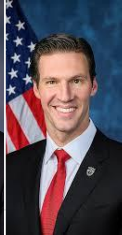
Congressman Pat Harrigan NC 10 th District