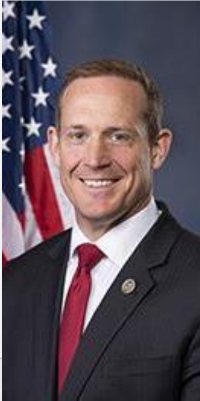
Senator Ted Budd