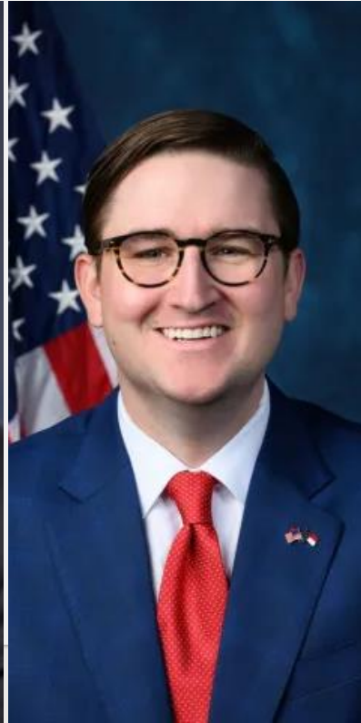
Congressman Addison McDowell NC 6 th District