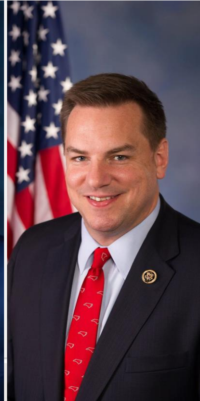
Congressman Richard Hudson NC 9 th District